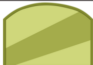
Half Round Window Blinds & Half Round Window Shades